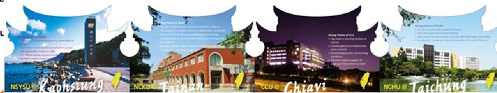
National Sun Yat-sen University National Cheng Kung University National Cheng Chung University National Chung Hsing University

International Summer School 2016 at the Taiwan Comprehensive University System